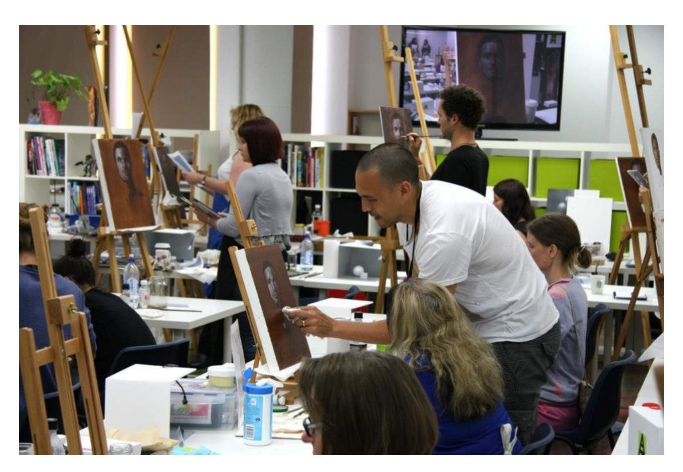
Above - a studio session in progress at the 2014 Oil Painting Workshop

Numbers are strictly limited so book now.